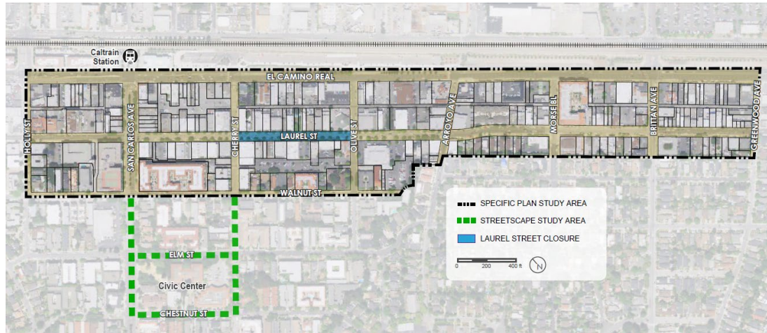
Figure 1. Downtown Specific Plan + Streetscape Master Plan Study Area

Walnut Street to the west. The Downtown Specific Plan + Streetscape Master Plan will also address the streets around the Civic Center: San Carlos Avenue, Cherry Street, Elm Street, and Chestnut Street as indicated by the green dotted line in Figure 1 below.