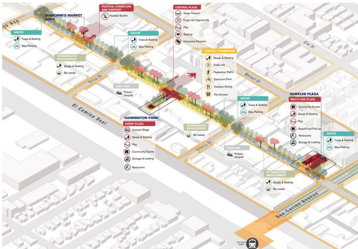
Figure 4. Streetscape Design for 600, 700, and 800 blocks of Laurel Street

At the end of the meeting, the DTAC endorsed the street design concepts (see Exhibit A to Resolution).